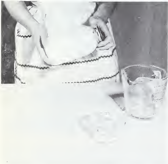
N-39861--Or you can reconstitute the milk by shaking with water in a jar.